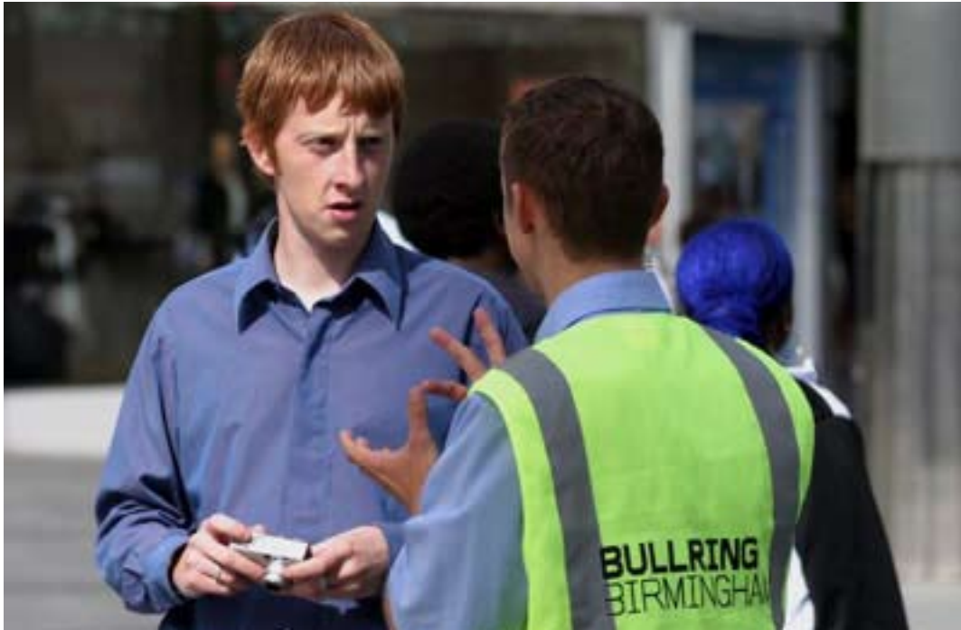
iv. Birmingham Bullring

Endorsing the Fareham shopping centre's position, a centre manager in neighbouring Havant offered his own procedural arrangements to a local newspaper, by way of further explanation: