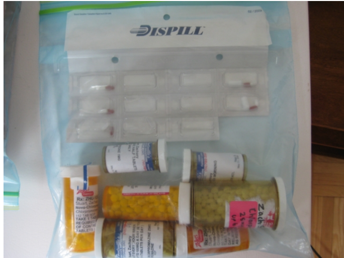
Photo of the pills that I was physically restrained by staff and forced to take against my will if I did not agree to take them myself.

The above is only a partial list of some of the things I have been experienced to while being a Crown Ward of the York Region CAS. While being declared a ward, I have been held in what I would consider nothing less than a prison. In the last few days I have been given information by others which certainly supports that my experience of abuse is not isolated. Attached to my letter is a page containing comments from other persons who have been victimized at Youthdale Treatment Centres just as I was abused. It seems that many of the abusive tactics used against me while in care have been used against other children in the same way. It would seem that Youthdale have got the art of child abuse down to a science where they can abuse kids and keep the evidence and their wrongdoing hidden from the public.