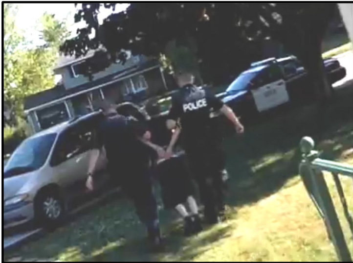
Photo from a video taken showing two Ontario Provincial Police officers dragging a handcuffed teen away in his sock feet because the children's aid society wanted to force the teen to live with his abusive mother and not with his loving father.