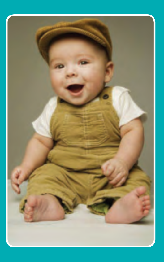
Your child, your voice, your love. READ TO YOUR BABY