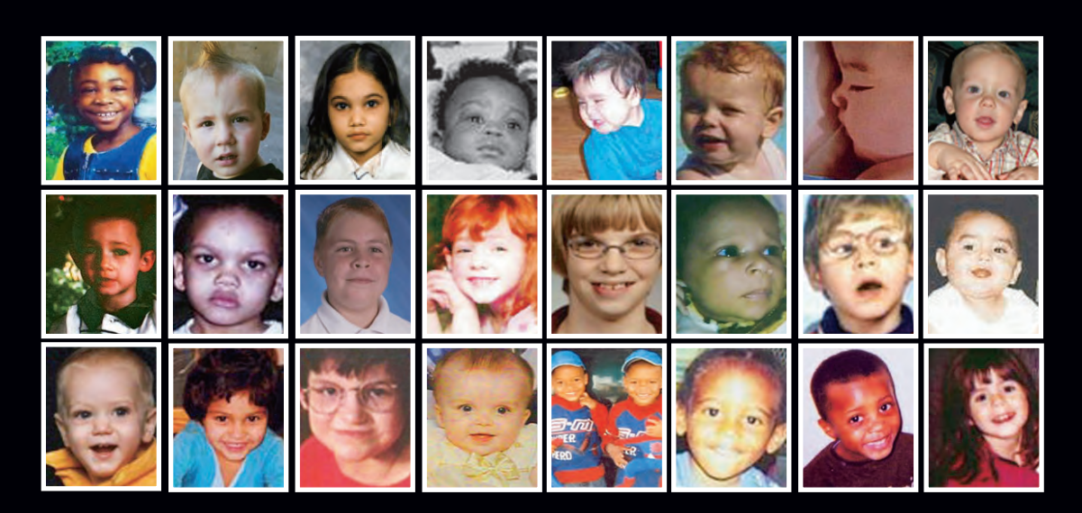
We Can Do Better

Child Abuse and Neglect Deaths in America