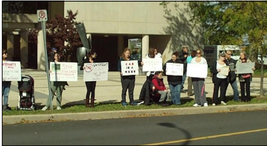
Protesters Rally outside St. Catharine's Courthouse