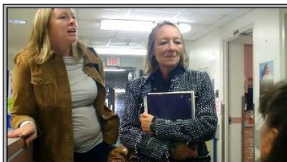
Two FACS Niagara workers at GNGH desk in Niagara Falls, Canada