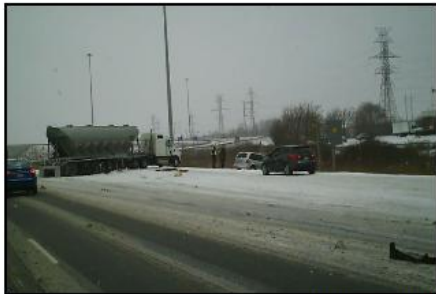
Pat Niagara Photo