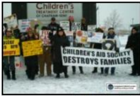
Pat Niagara Photo